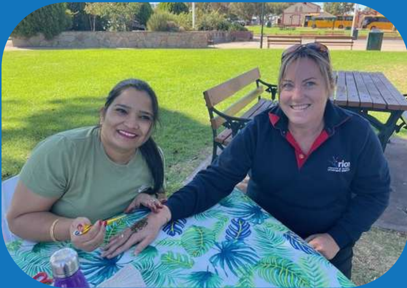
Above: Multicultural Festival, Gladstone Square

**** clinic may be subject to change due to staff sick leave or training.