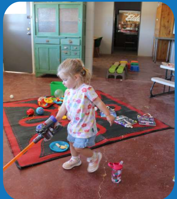
Right: Yunta Play Day